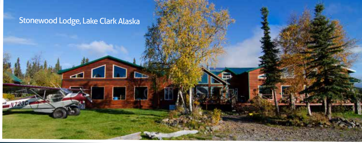
Stonewood Lodge, Lake Clark Alaska