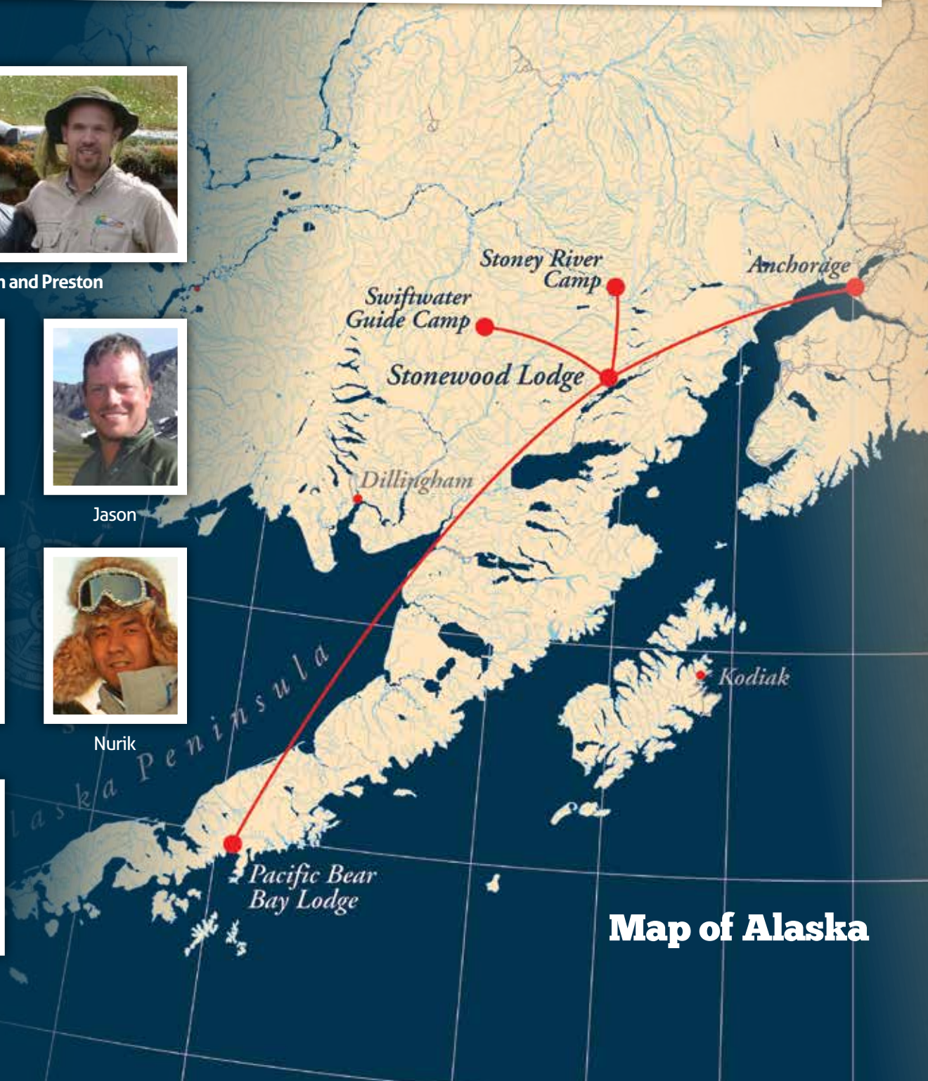
Map of Alaska