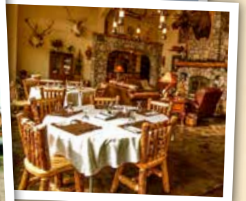
Your Basecamp, Stonewood Lodge Lake Clark Alaska