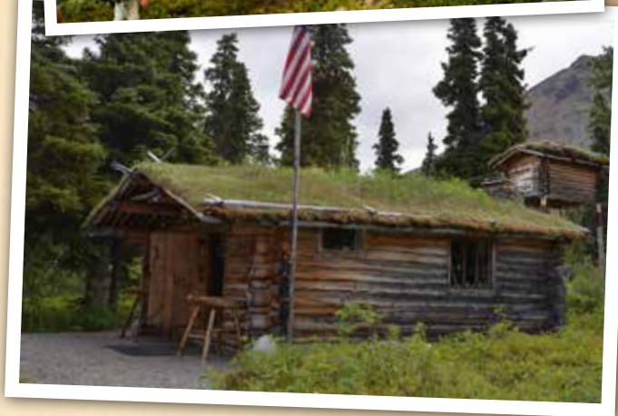
Visit Dick Proenneke's Cabin